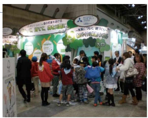
At Eco-Products 2012

The booth displayed at Eco-Products 2012 featured a tunnel within a simulated forest that enabled visitors to experience the entire forest cycle, from afforestation to product use, in order to convey the concept of "future-oriented paper manufacturing."